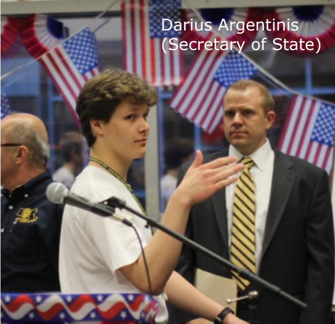
Darius Argentinis (Secretary of State)